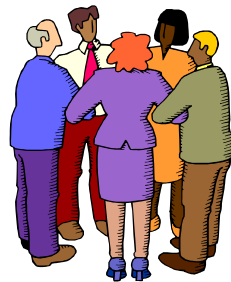
Working together improving the local community

RC&D Councils provide a focal point of local leadership and bring together private citizens and local, state and federal agencies to improve the economic, social and environmental well-being of their area. The premise of the RC&D Program is that local people know what is best for their communities.