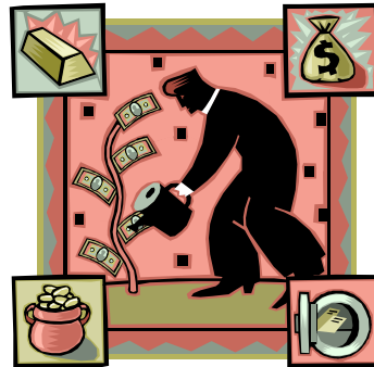
Multiple Sources of Funding

Funding for the RC&D Council comes from membership fees, grants, donations, and income producing projects.