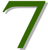
Serving Seven Counties

Southeastern Pennsylvania Resource Conservation & Development (SEPA RC&D) Council covers seven counties: Bucks, Berks, Chester, Delaware, Lehigh, Montgomery, and Northampton. SEPA RC&D Council is made up of representatives from the counties in the Council Area. The Council includes private citizens, representatives from conservation districts, state and local government agencies, regional authorities, organizations, and businesses. All Council members serve as volunteers.